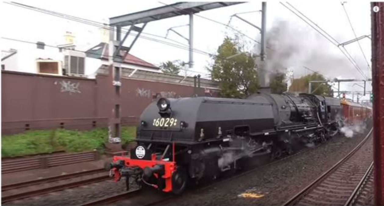
Australia: Sydney's Great Steam Train Race 2018