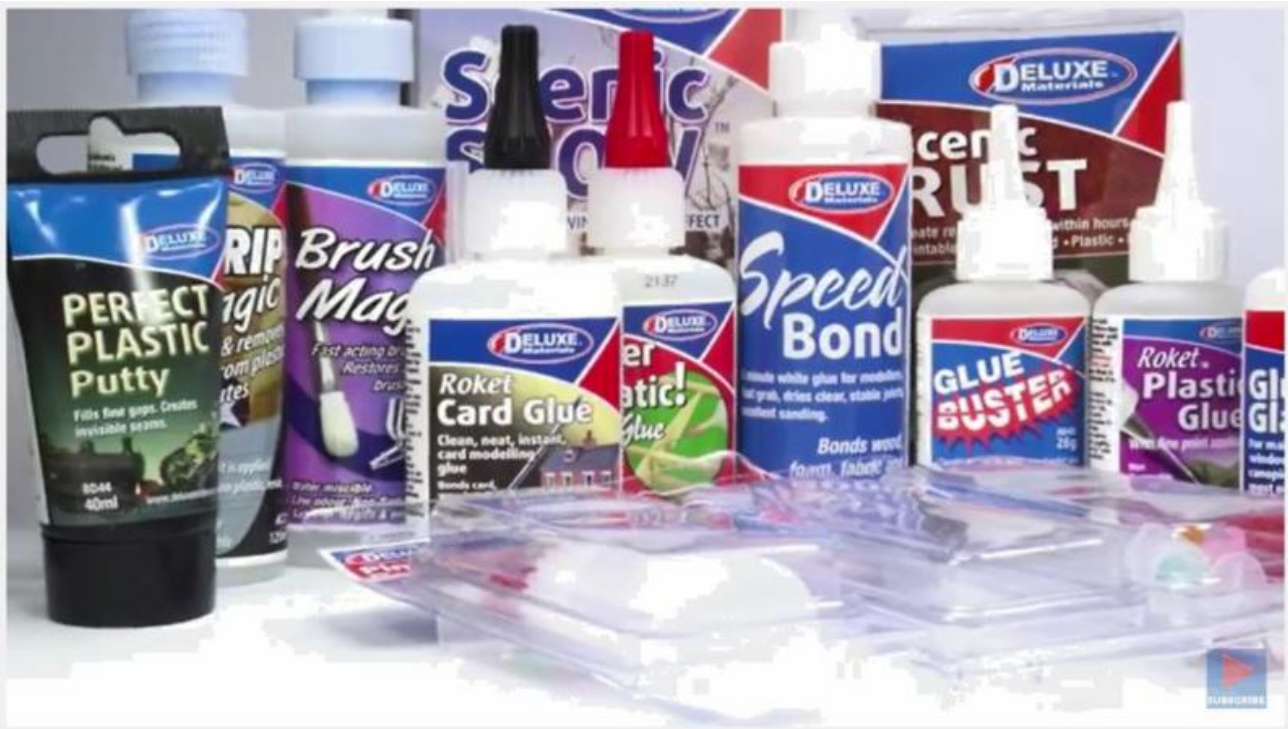
Railway Modelling Products - Product Range