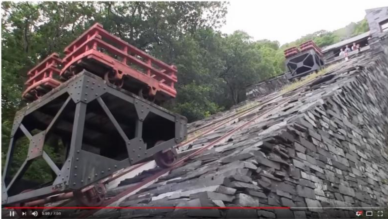
Dinorwic Vivian Quarry incline V2