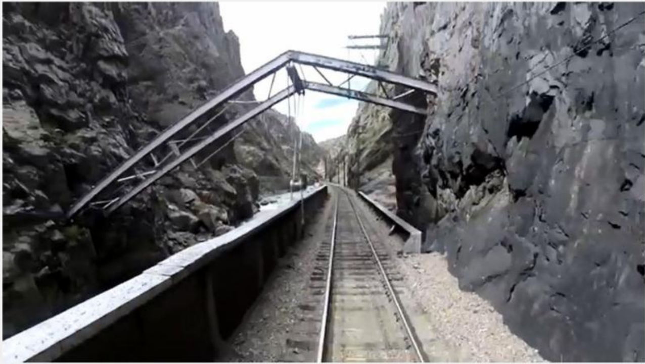
Royal Gorge Route Railroad – Driver's Eye View